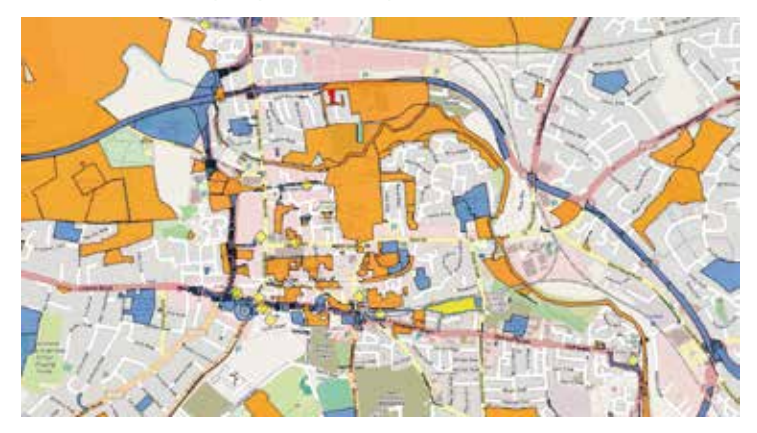
Fig. 2: Essex Property Asset Map (EPAM)

Greater cooperation between central and local government in this sphere was proposed by Lord Heseltine as one of the recommendations of his No Stone Unturned report, which suggested that the GPU should work with local authorities to identify and publish details of all surplus and derelict public land on the e-PIMS database so that LEPs and local authorities can collaborate to bring this land back into reuse in support of the local economic strategy. This sparked the creation of a joint programme, One Public Estate, between the GPU, LGA and local authority partners aimed at 'unblocking' any existing barriers between asset holders which may be preventing a more integrated approach. Among the barriers identified are ineffective channels of communication between asset holding groups, a lack of join-up between public services, and the absence of a mechanism through which to view local authority assets online. The programme only started in June 2013 so it is early days. However one of the pilots, Essex County Council, together with local public sector partners and the East of England LGA have been able to draw together all the major public sector ownerships online through the Essex Property Asset Map (EPAM), helping to identify under-utilised and vacant assets.